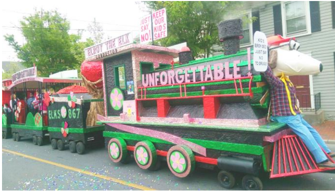
Winchester Lodge 867 Float