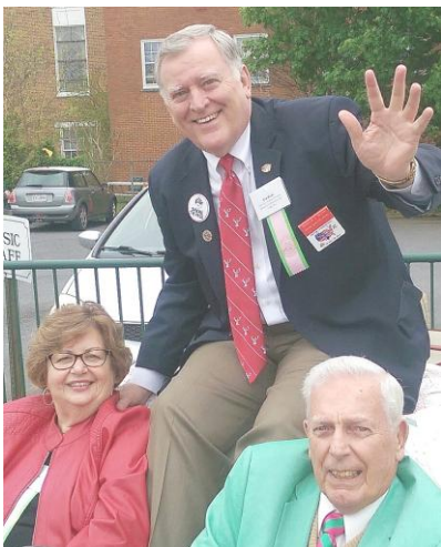
Let the parade begin!!!