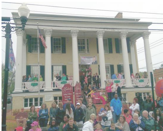
The parade route passes by the former downtown Winchester Elks 867 building

Winchester, long known as the “Apple Capital,” also has an interesting Revolutionary and Civil War History. Located at the entrance to the Shenandoah Valley, in one of the most beautiful areas of Virginia, the area was the political training ground for George Washington, who was elected to his first public office as its representative to the House of Burgesses. Also, because of its locations and roadways into Virginia, it was a strategic prize during the Civil War,