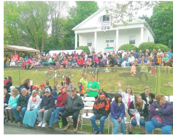
Parade Route Photo 1

The Parade Route took us through the historic downtown and past many of the revolutionary and civil war era homes, with their lovely lawns and large porches. Seating along the many streets was sold by area churches as fundraisers, and often behind the rows of spectators along the