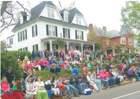
Parade Route Photo 2

streets and sidewalks, the homeowners would be entertaining large parties on their property. Winchester is a lovely setting for this fun, hometown, family-oriented