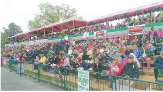
Grandstands and Judges Station

and is said to have changed hands between the Confederate and Union Armies seventy times during the War years.