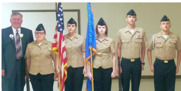
Color Guard at Claremore Lodge for the 100 Year Celebration for the Claremore and Miami Lodges