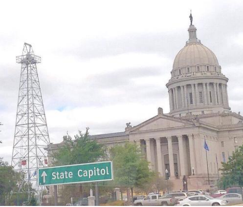
The Oklahoma Capital has an oil producing well on its front lawn